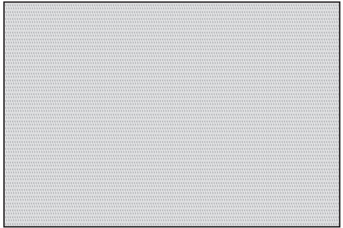
PATTERN DETAIL 1:1

NOTE: THE ABOVE ILLUSTRATION IS FOR ORIENTATION ONLY. ACTUAL PATTERN MAY VARY FROM PATTERN SHOWN.