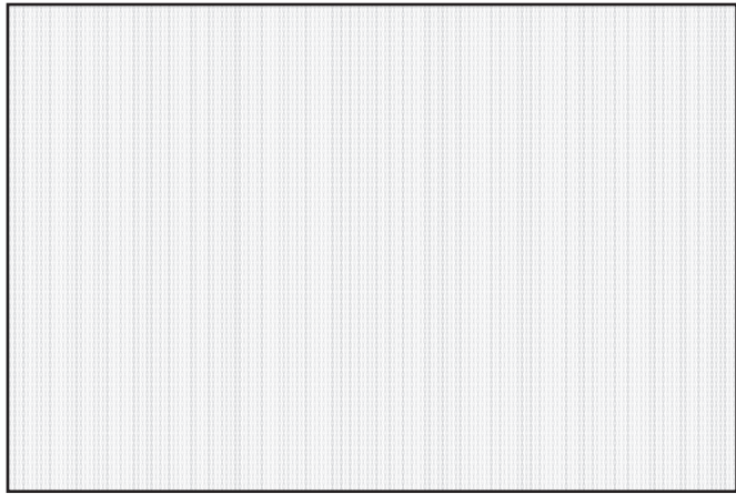
PATTERN DETAIL 1:1

NOTE: THE ABOVE ILLUSTRATION IS FOR ORIENTATION ONLY. ACTUAL PATTERN MAY VARY FROM PATTERN SHOWN.