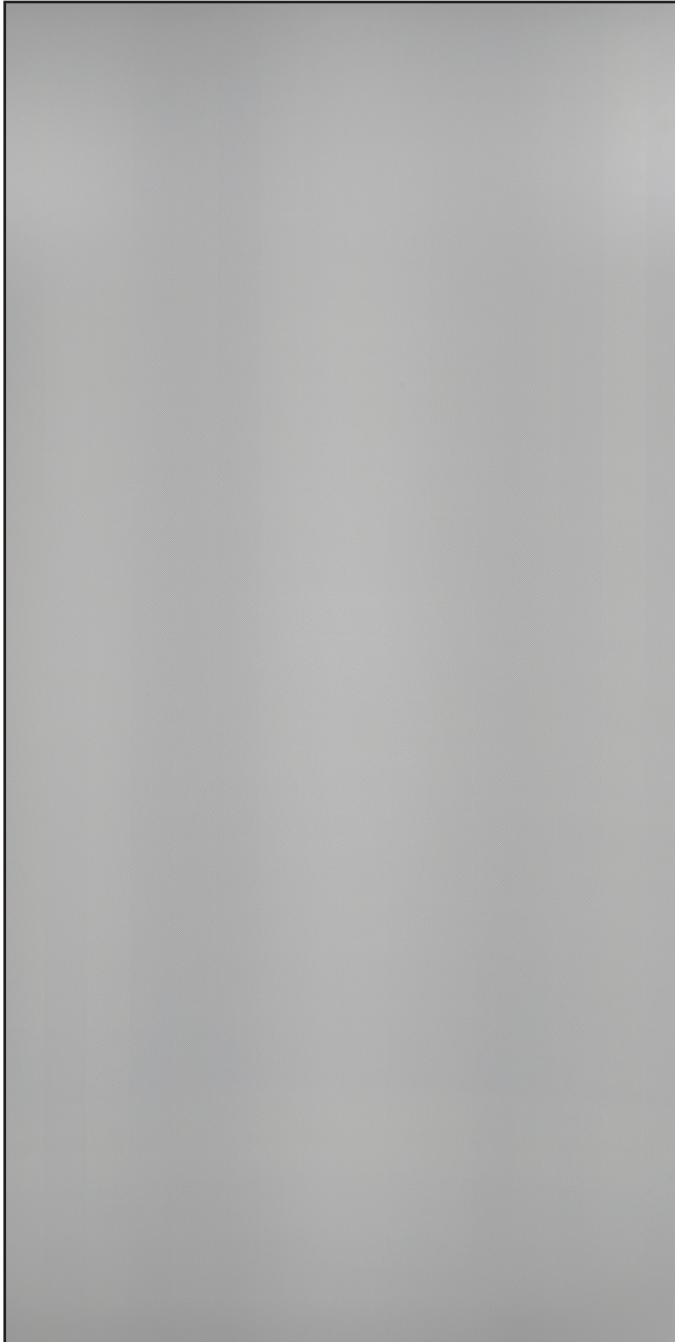
FULL SHEET PATTERN ORIENTATION

NOTE: THE ABOVE ILLUSTRATION IS FOR ORIENTATION ONLY. ACTUAL PATTERN MAY VARY FROM PATTERN SHOWN.