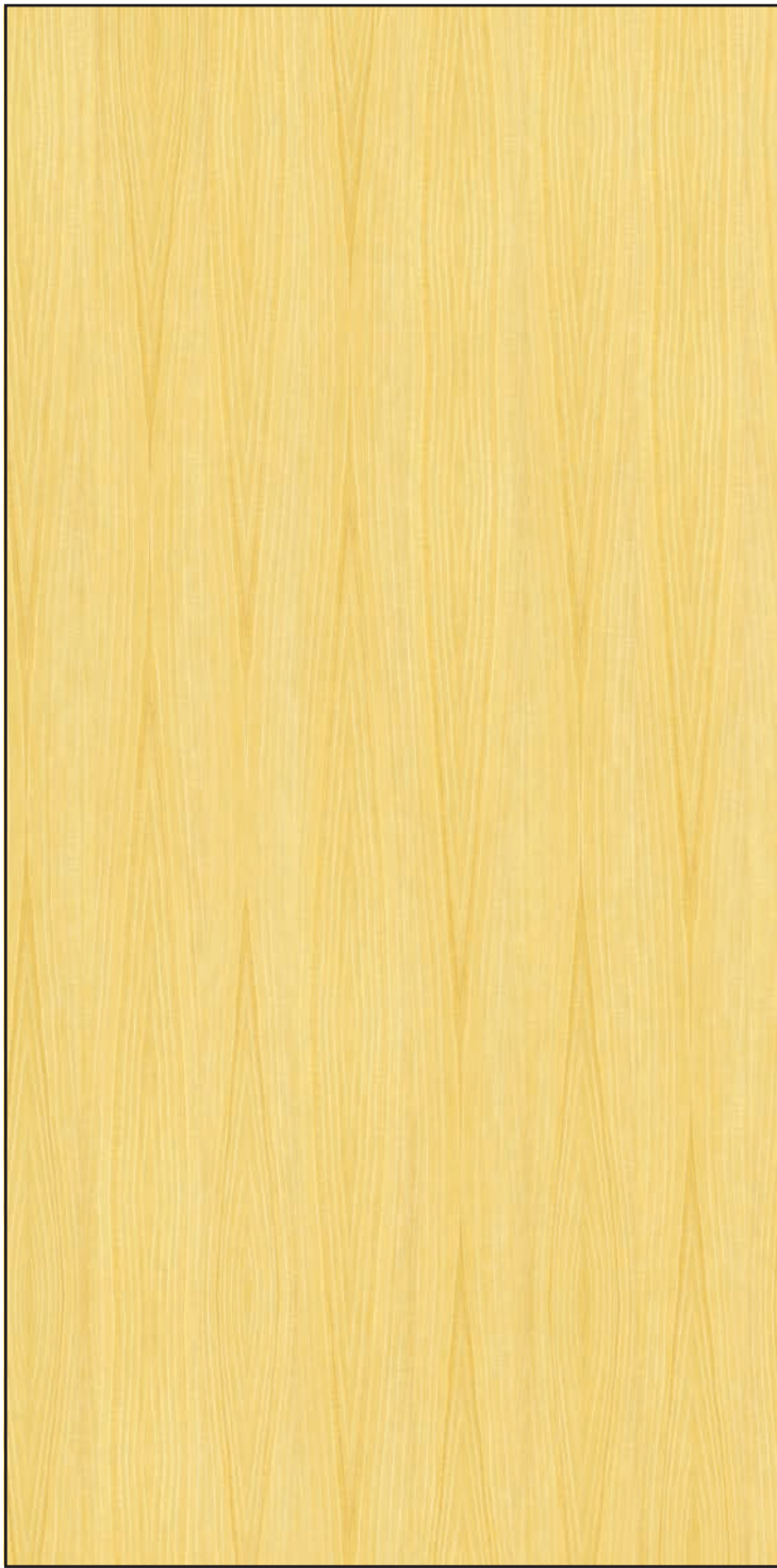
FULL SHEET PATTERN ORIENTATION