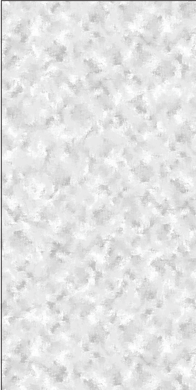
FULL SHEET PATTERN ORIENTATION

NOTE: THE ABOVE ILLUSTRATION IS FOR ORIENTATION ONLY. ACTUAL PATTERN MAY VARY FROM PATTERN SHOWN.