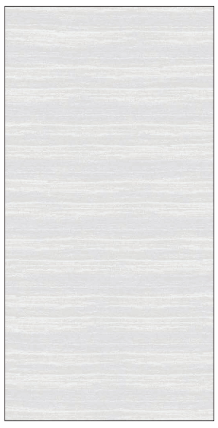
FULL SHEET PATTERN ORIENTATION

NOTE: THE ABOVE ILLUSTRATION IS FOR ORIENTATION ONLY. ACTUAL PATTERN MAY VARY FROM PATTERN SHOWN.