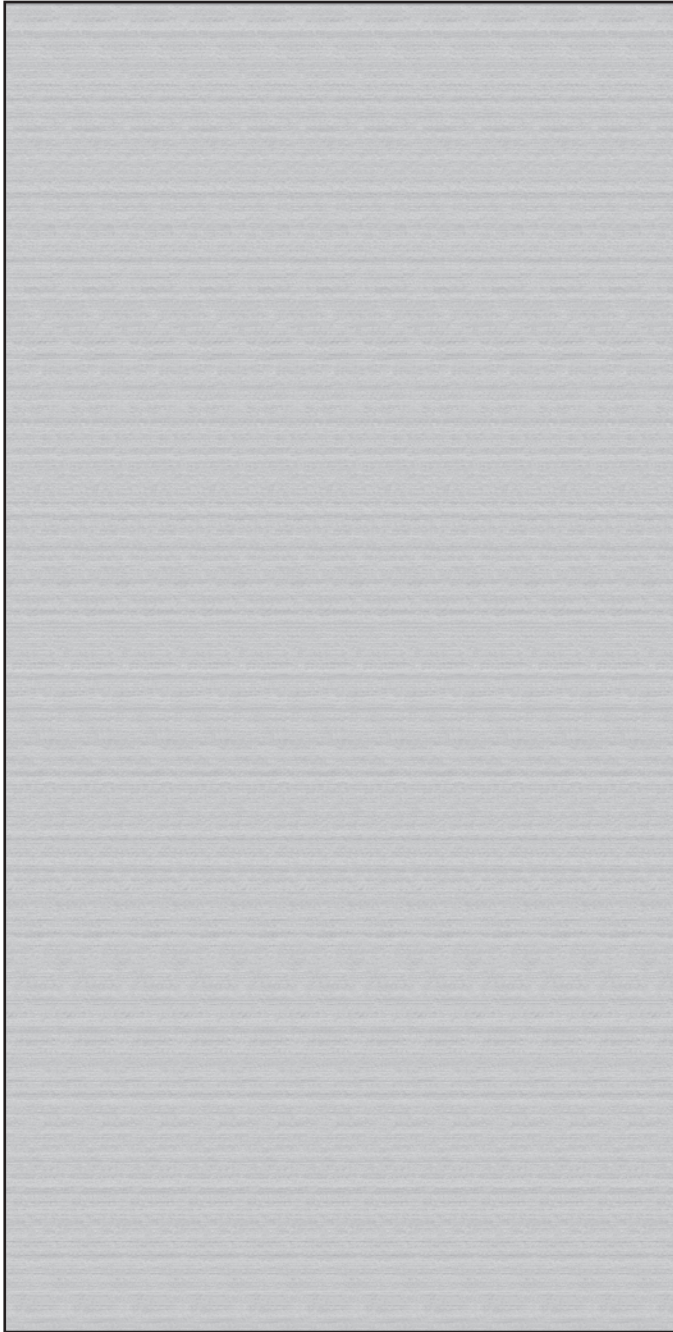
FULL SHEET PATTERN ORIENTATION

NOTE: THE ABOVE ILLUSTRATION IS FOR ORIENTATION ONLY. ACTUAL PATTERN MAY VARY FROM PATTERN SHOWN.