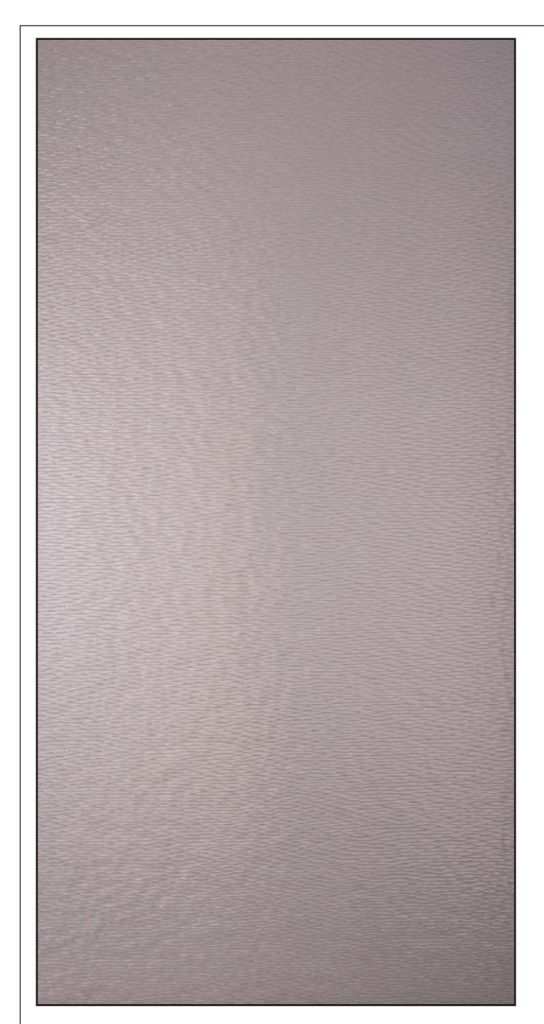
FULL SHEET PATTERN ORIENTATION

NOTE: THE ABOVE ILLUSTRATION IS FOR ORIENTATION ONLY. ACTUAL PATTERN MAY VARY FROM PATTERN SHOWN.