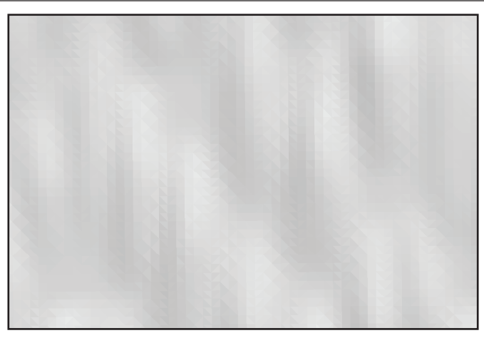
TEXTURE DETAIL 1:1

NOTE: THE ABOVE ILLUSTRATION IS FOR ORIENTATION ONLY. ACTUAL PATTERN MAY VARY FROM PATTERN SHOWN.