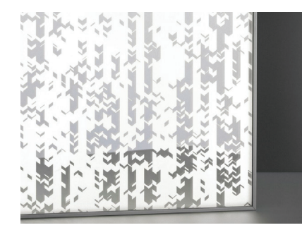
ALPINE I (Shown in Vertical Orientation)