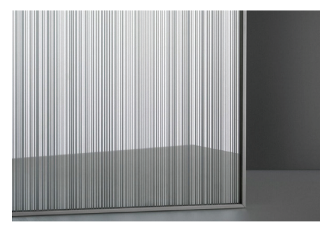
TEMPO I (Shown in Vertical Orientation)