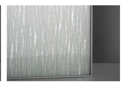
STRING OF PEARLS II (Shown in Vertical Orientation)