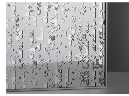
ALPINE II (Shown in Vertical Orientation)