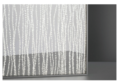
STRING OF PEARLS I (Shown in Vertical Orientation)