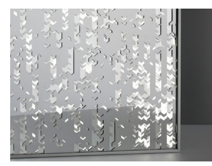
ALPINE II (Shown in Vertical Orientation)