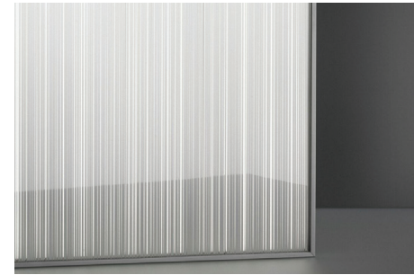
TEMPO II (Shown in Vertical Orientation)