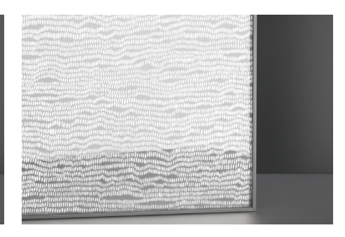
BREEZE I (Shown in Horizontal Orientation)