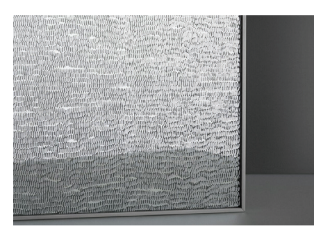
BREEZE II (Shown in Horizontal Orientation)