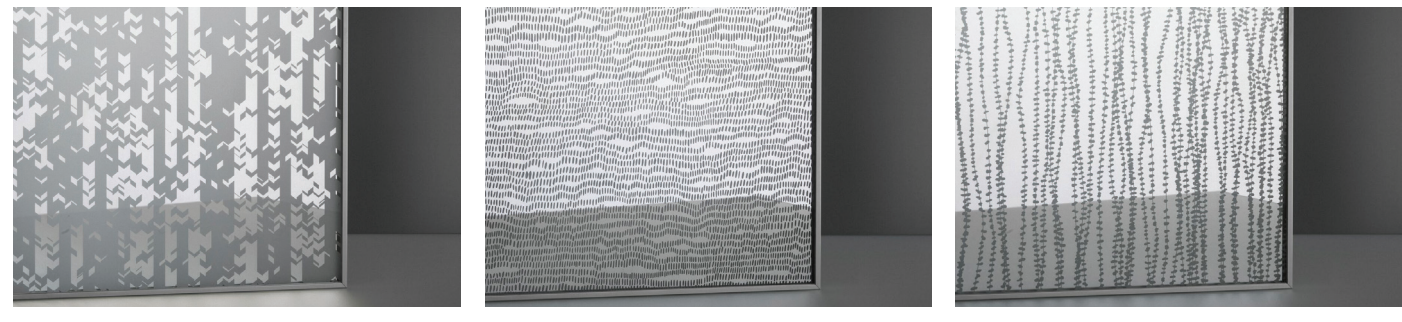
ALPINE I (Shown in Vertical Orientation)