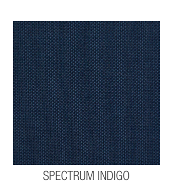
SUNBRELLA® FABRIC DESIGNS BY F+S