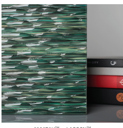
\mathsf{NUV'EAU^{^{\mathsf{TM}}}} + \mathsf{LAGOON^{^{\mathsf{TM}}}}