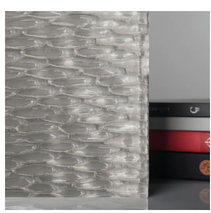
NUV'EAU + TAUPE