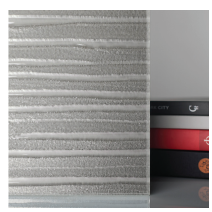
HIKARU + TAUPE