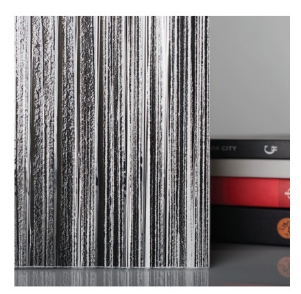
\mathsf{HIKARU^{TM}} + \mathsf{OBSIDIAN^{TM}}

All designs shown below can be specified in both horizontal and vertical orientations.