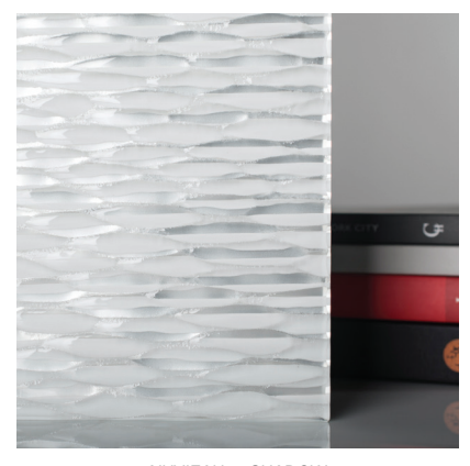
\mathsf{NUV'EAU} + \mathsf{SHADOW}