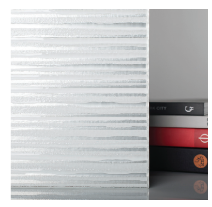
\mathsf{HIKARU} + \mathsf{SHADOW}^{\scriptscriptstyle\mathsf{TM}}