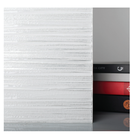
HIKARU + SHIMMER™