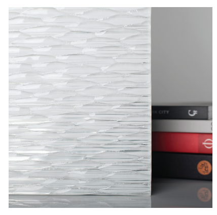
\mathsf{NUV'EAU} + \mathsf{SHIMMER}