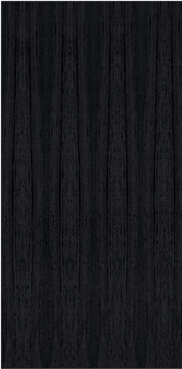
FULL SHEET PATTERN ORIENTATION