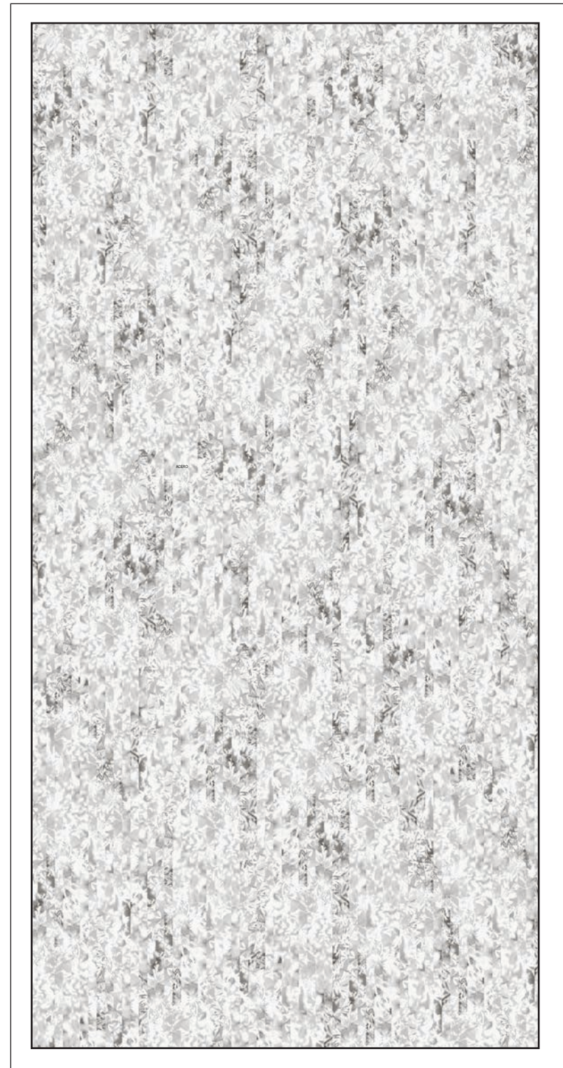
FULL SHEET PATTERN ORIENTATION